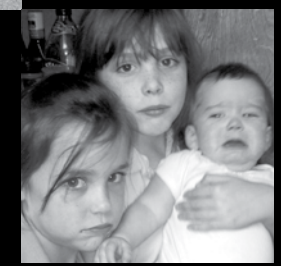
MISSION: WITH DIGNITY AND RESPECT, POWERED BY VOLUNTEERS, MEND'S MISSION IS TO BREAK THE BONDS OF POVERTY BY PROVIDING BASIC HUMAN NEEDS AND A PATHWAY TO SELF-RELIANCE.